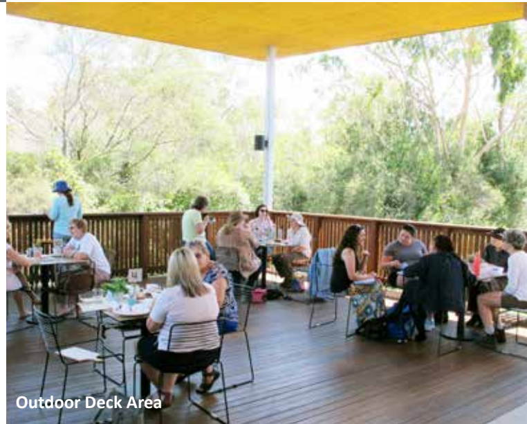
Outdoor Deck Area