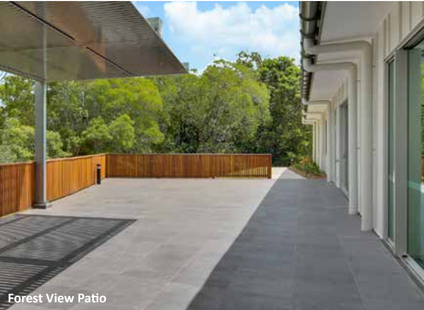
Forest View Patio