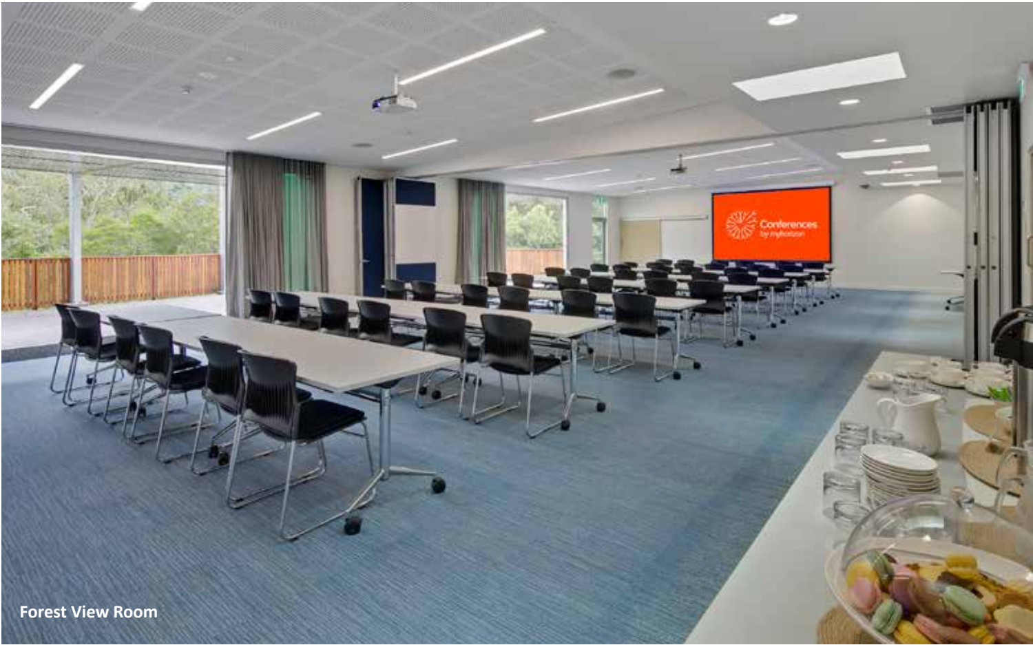
Forest View Room